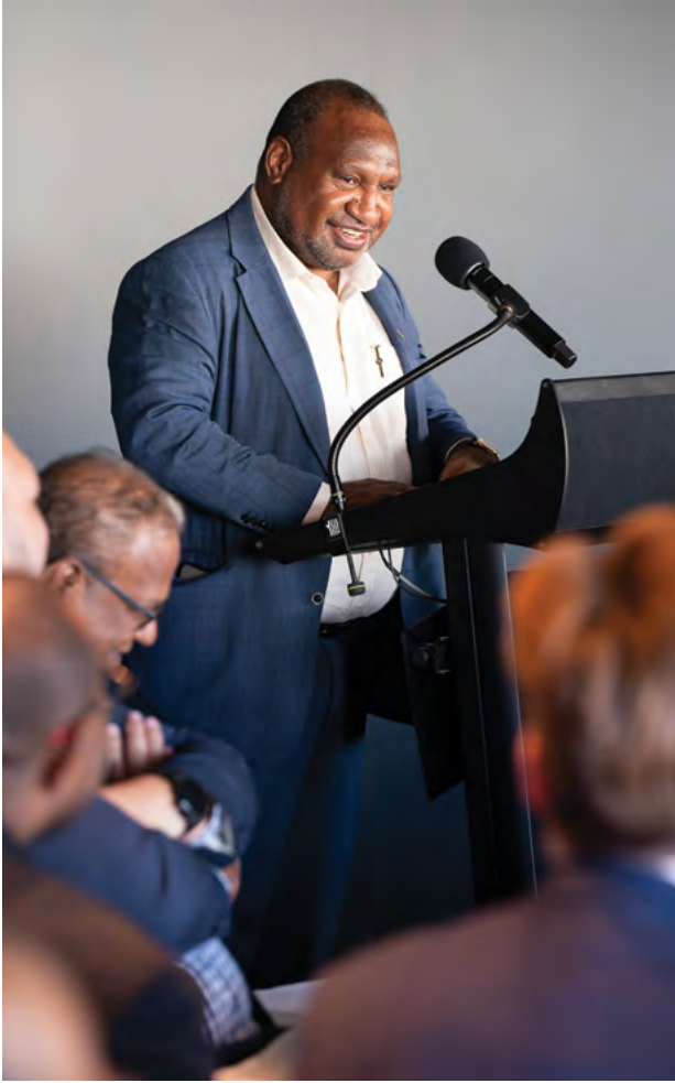
The Prime Minister of Papua New Guinea, the Hon James Marape, speaks at a welcome lunch for the Papua New Guinea Executive Leadership Retreat