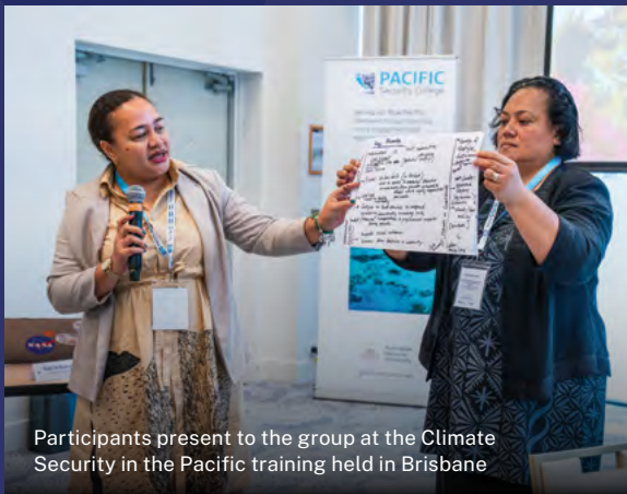
Participants present to the group at the Climate Security in the Pacific training held in Brisbane

Our short courses usually run for three days, but can be lengthened or shortened around the preferences of the Forum member.