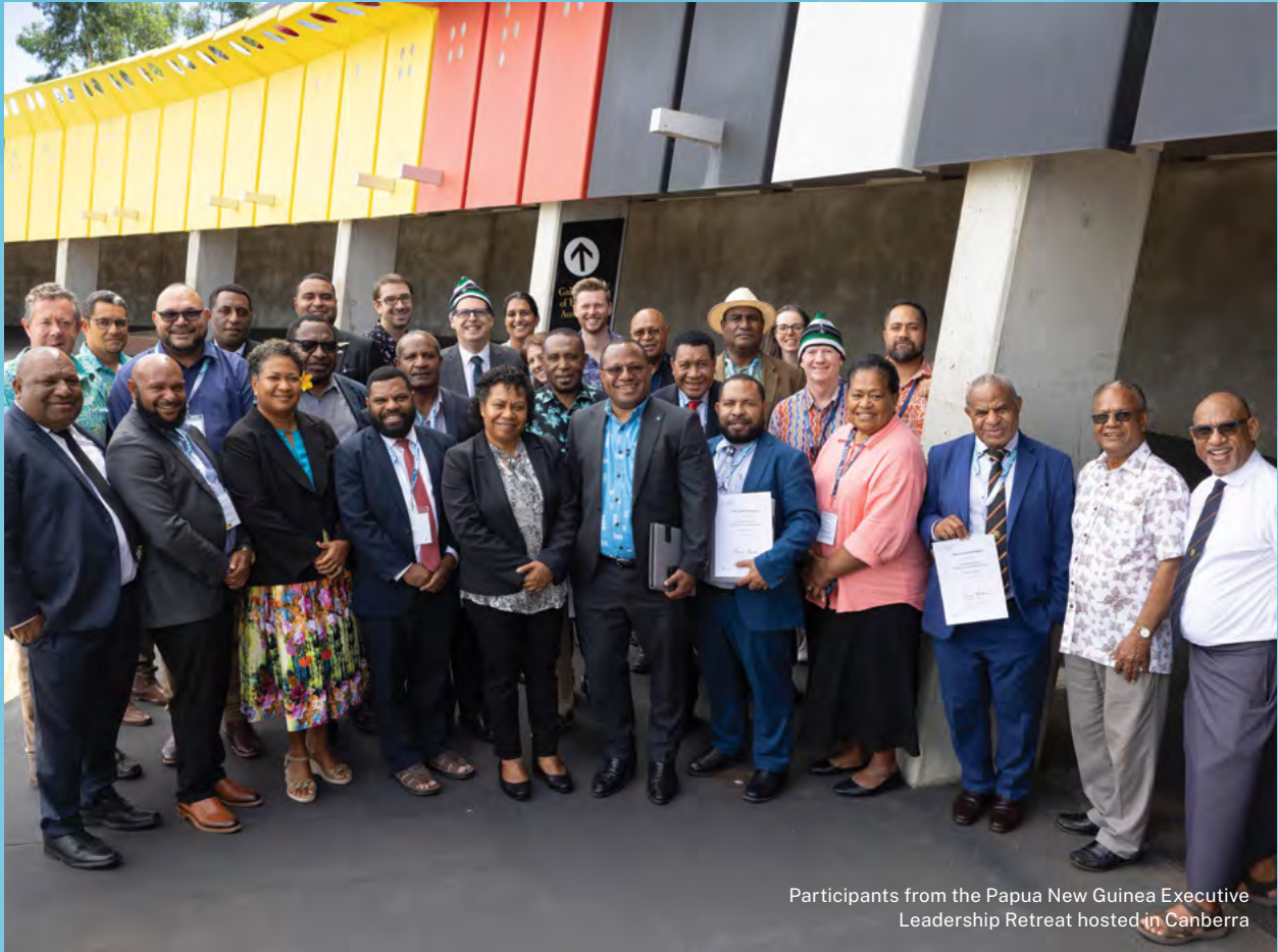
Participants from the Papua New Guinea Executive Leadership Retreat hosted in Canberra