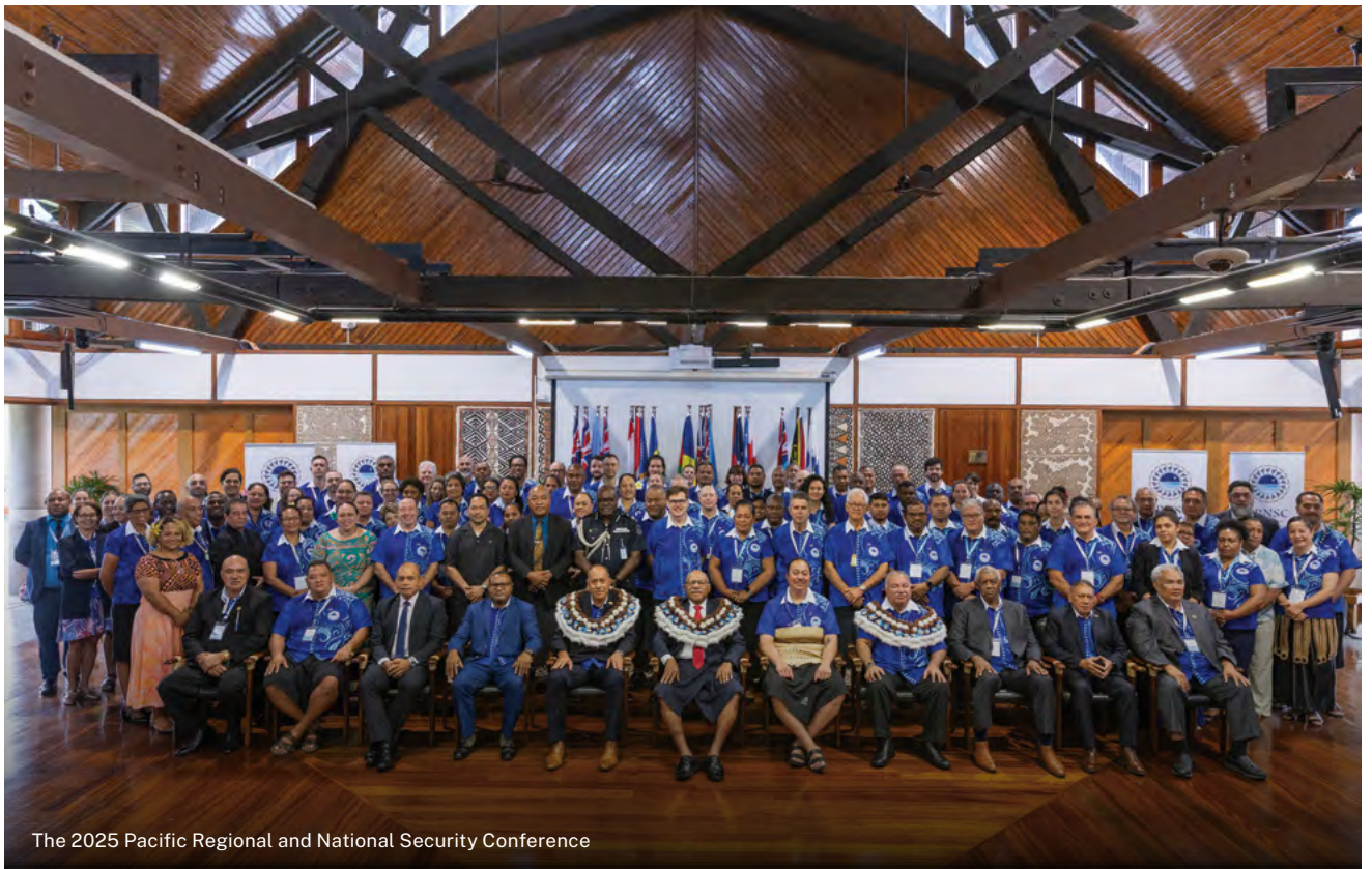
The 2025 Pacific Regional and National Security Conference

We aim to contribute to building a sense of community among the security policymakers of the Blue Pacific Continent.