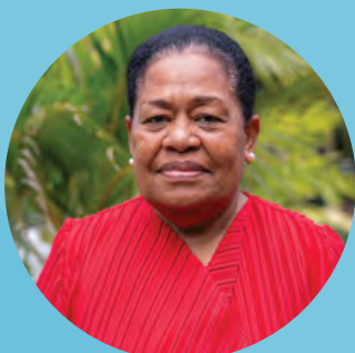
Litea Seruiratu Colonel (Retd), Republic of Fiji Military Forces