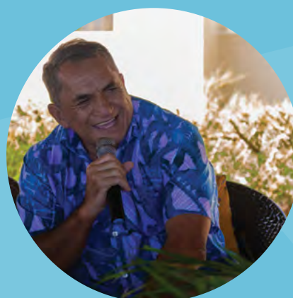
National Security Director Maara Tetava speaking during the Regional Workshop on National Security Strategies

→ The Honourable Mark Brown Prime Minister of Cook Islands