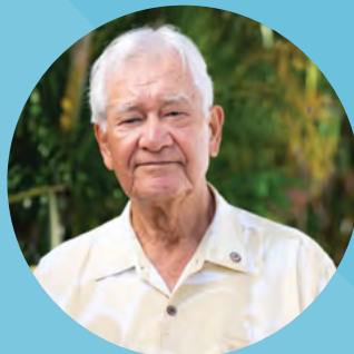
Tuiloma Neroni Slade Former Pacific Islands Forum Secretary General