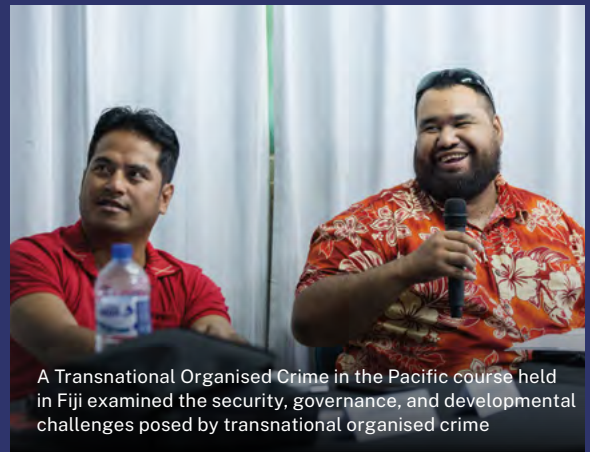
A Transnational Organised Crime in the Pacific course held in Fiji examined the security, governance, and developmental challenges posed by transnational organised crime

By staying connected through this network, alumni continue to play an influential role in addressing emerging challenges and advancing cooperative security efforts across the region.