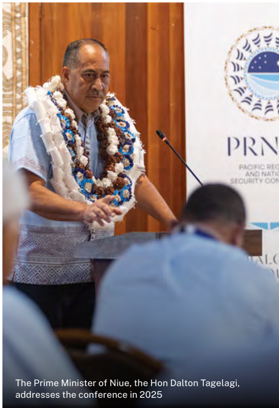
The Prime Minister of Niue, the Hon Dalton Tagelagi, addresses the conference in 2025