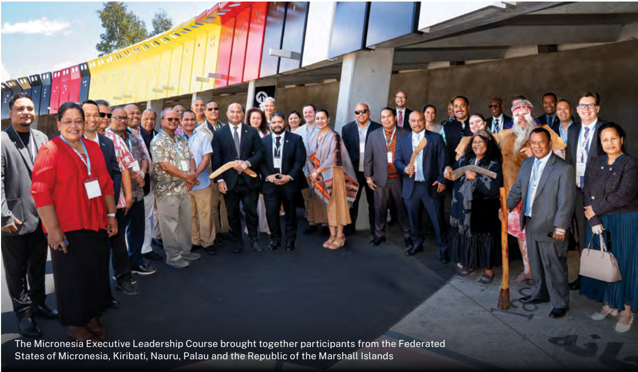
The Micronesia Executive Leadership Course brought together participants from the Federated States of Micronesia, Kiribati, Nauru, Palau and the Republic of the Marshall Islands