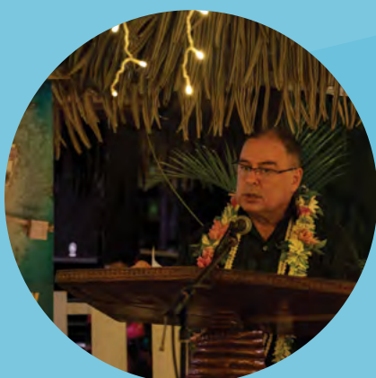
Cook Islands Prime Minister, the Hon Mark Brown, at the launch of the Cook Islands National Security Policy

“In formulating our national security policy, the Cook Islands has also taken a broad-based policy approach.