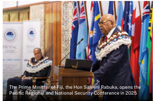
The Prime Minister of Fiji, the Hon Sitiveni Rabuka, opens the Pacific Regional and National Security Conference in 2025

The official report from the 2025 Pacific Regional and National Security Conference was launched on the sidelines of the 54th Pacific Islands Forum Leaders' Meeting in Honiara, Solomon Islands.