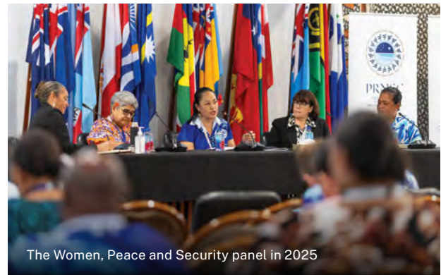
The Women, Peace and Security panel in 2025