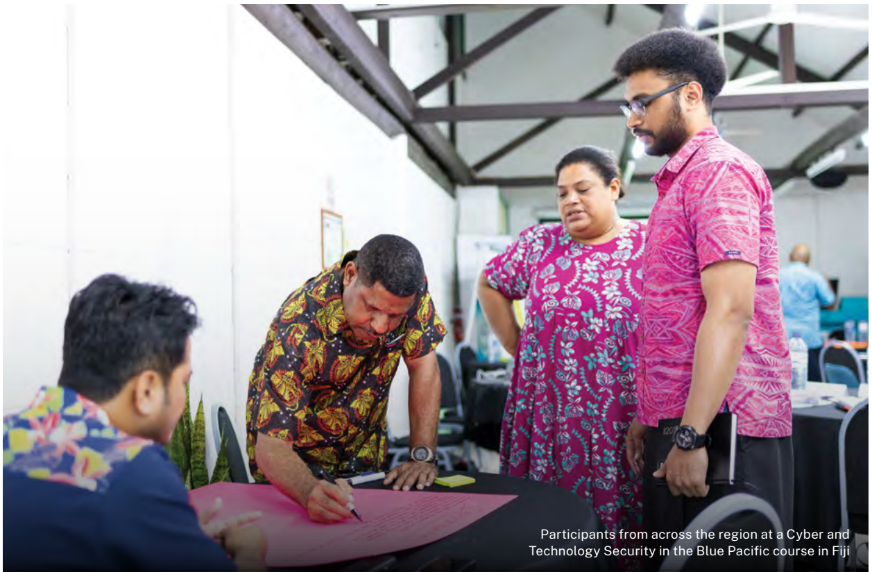
Participants from across the region at a Cyber and Technology Security in the Blue Pacific course in Fiji

Learning and training are at the heart of the College's efforts.