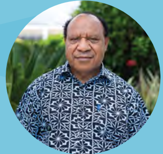
Rimbink Pato KC OBE Former Minister for Foreign Affairs, Papua New Guinea