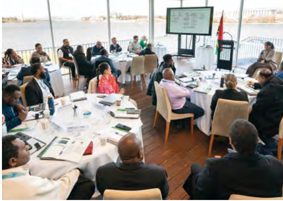
The Vanuatu Executive Leadership Course included sessions on relevant policy and security issues, such as climate change and economic growth.