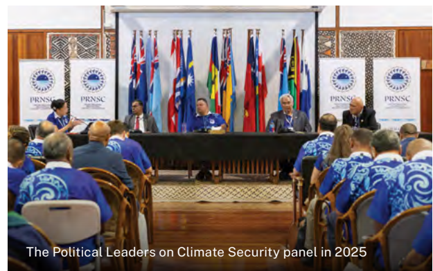
The Political Leaders on Climate Security panel in 2025